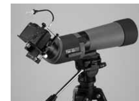
[ Digiscoping ]