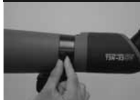
The lock screw.

The rotating tripod mount allows the spotting scope to be set at various angles while attached to a tripod. The body of the spotting scope can be turned by loosening the lock screw counterclockwise and rotating the spotting scope to the desired position.